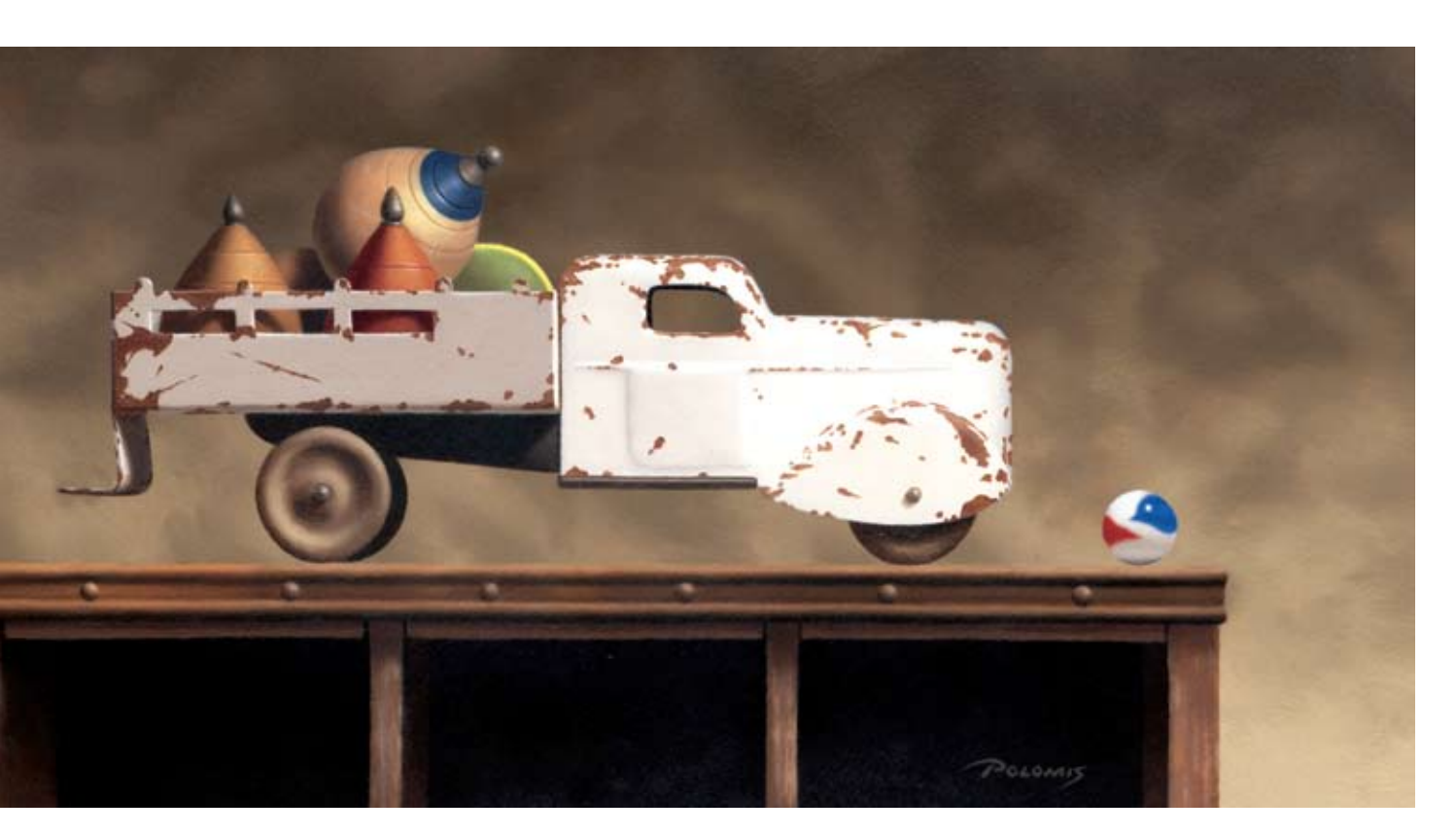
TRUCK'S TOPS, OIL ON MASONITE, 9 ½ X 18" The artist says: I was taken by the rust patterns against the stark white paint of this toy truck. I hope the viewer can appreciate that old worn objects can still be things of beauty.

into it, the cracks and paint chips, to show what's behind that initial veneer."