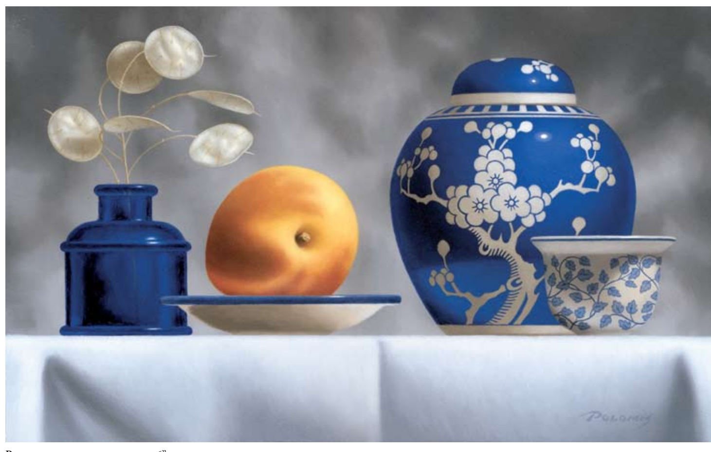
Peach , OIL ON MASONITE, 10 x 16" The artist says: I have a favorite blue ginger jar that I like to use in my paintings. This was a setup utilizing that jar, complemented with a peach and other objects.