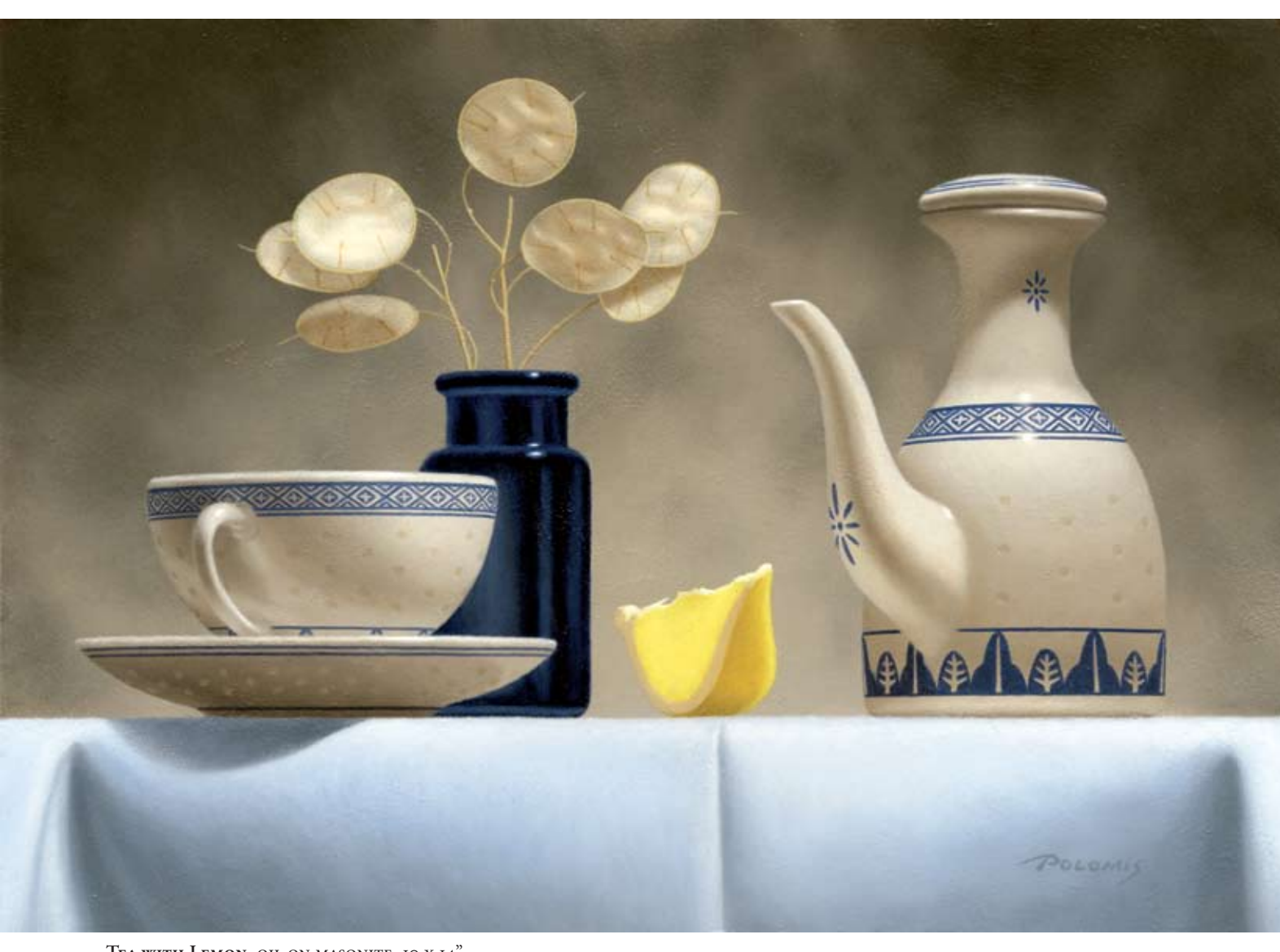
Tea with Lemon, Oil on Masonite, 10 x 14" The artist says: I love blue and white in combination. The little tea pot had an interesting shape and I also liked the simple pattern of its decoration. I hope the viewer can feel the painting's sense of calm, complementary balance.