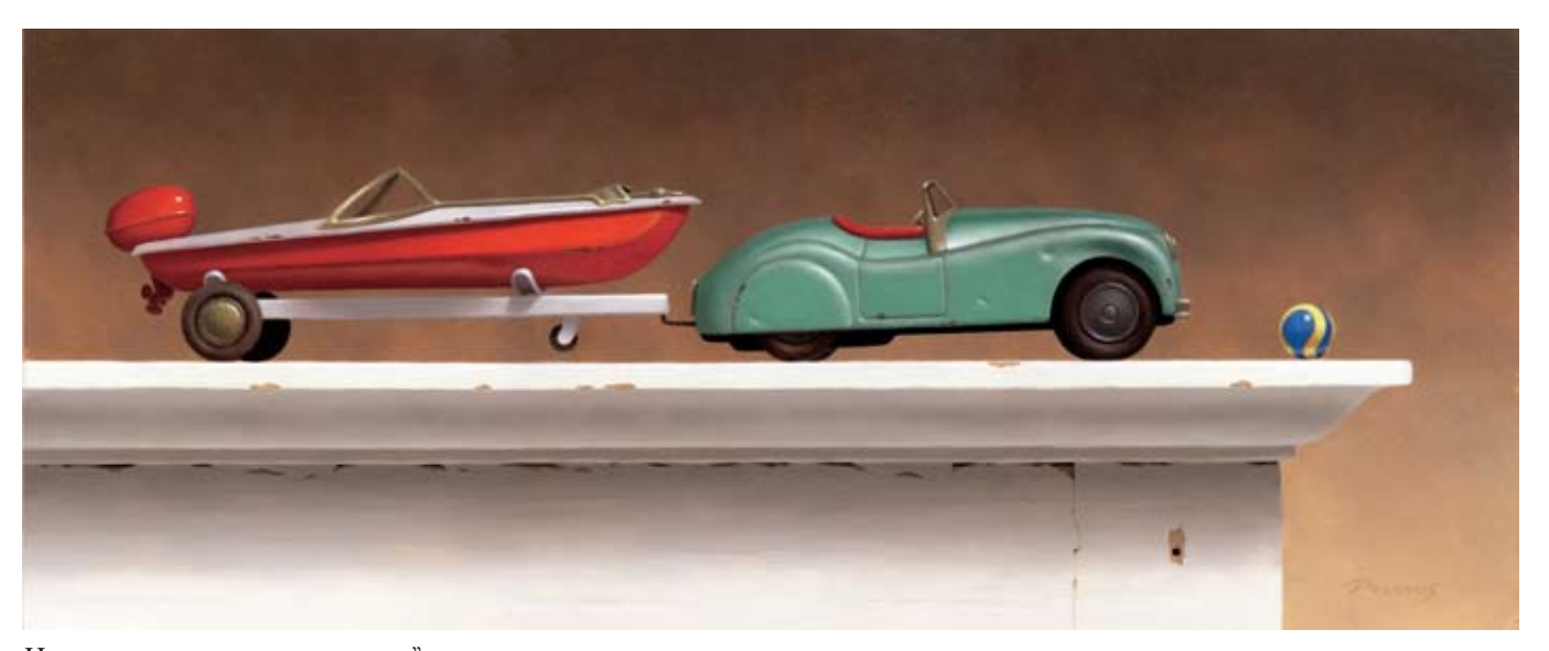
HITCHED, OIL ON MASONITE, 10 X 24" The artist says: I was attracted to the red of the boat's hull and the dents prevalent in the car. The objects combined to become an outgoing, yet slightly worn couple that I hope the viewer may find enjoyable.