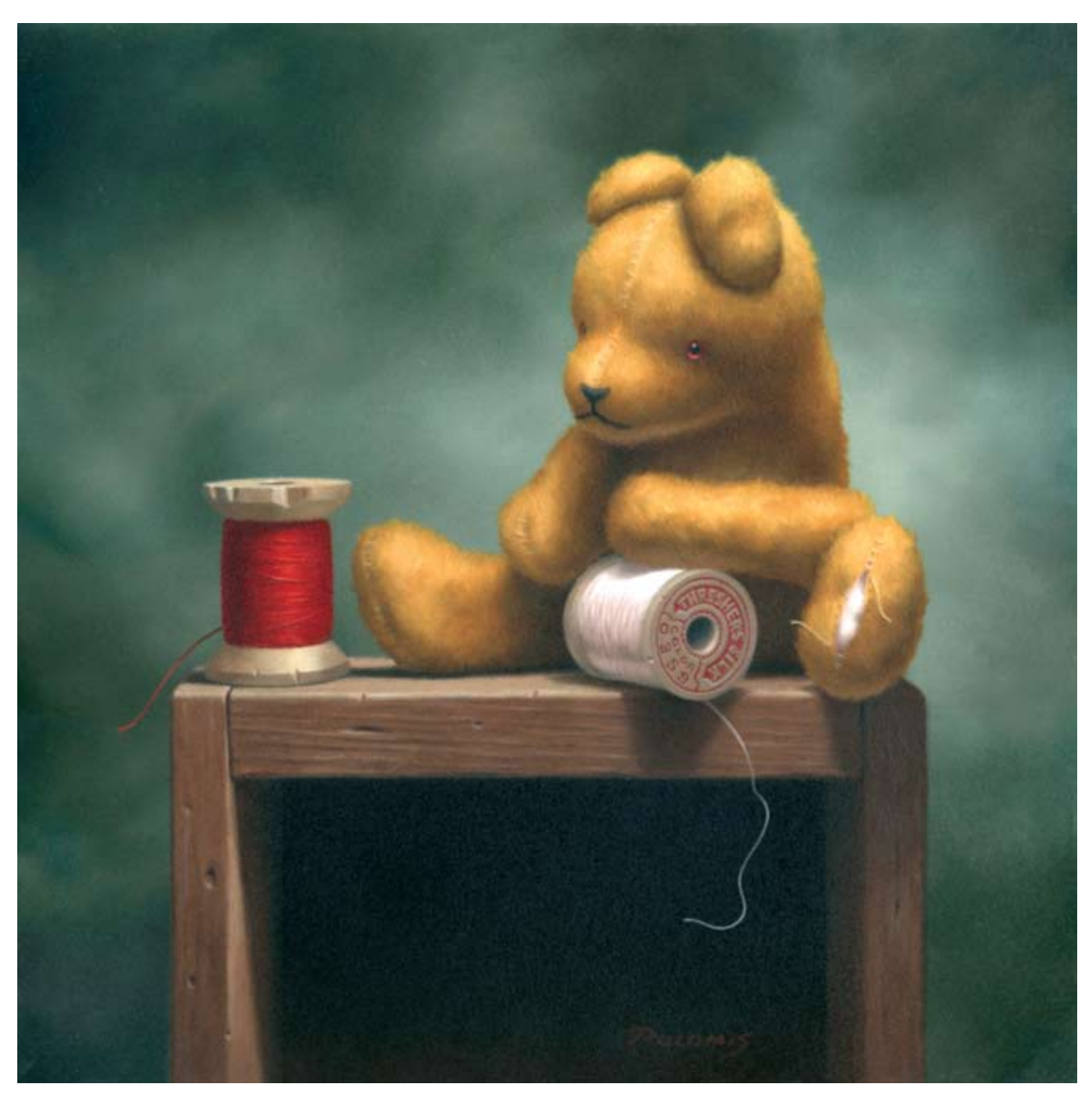
Ted Polomis, Thread Bear, oil on panel, 12 x 12"