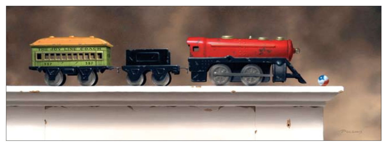
Ted Polomis , End of the Line, oil on panel, 9 x 25"