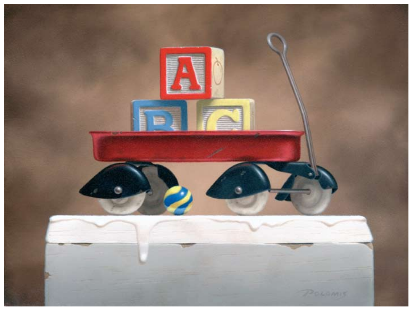
TED POLOMIS, LETTER CARRIER, OIL ON PANEL, 9 X 12"