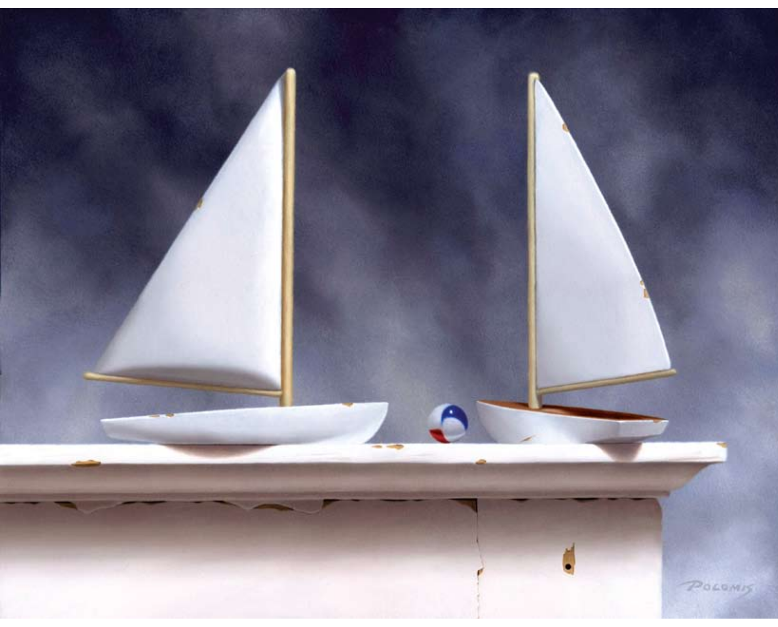
TED POLOMIS, MATCH RACE, OIL ON PANEL, 14 X 18"

in these latest works, explores a variety of canvas sizes, including several square and vertical pieces.